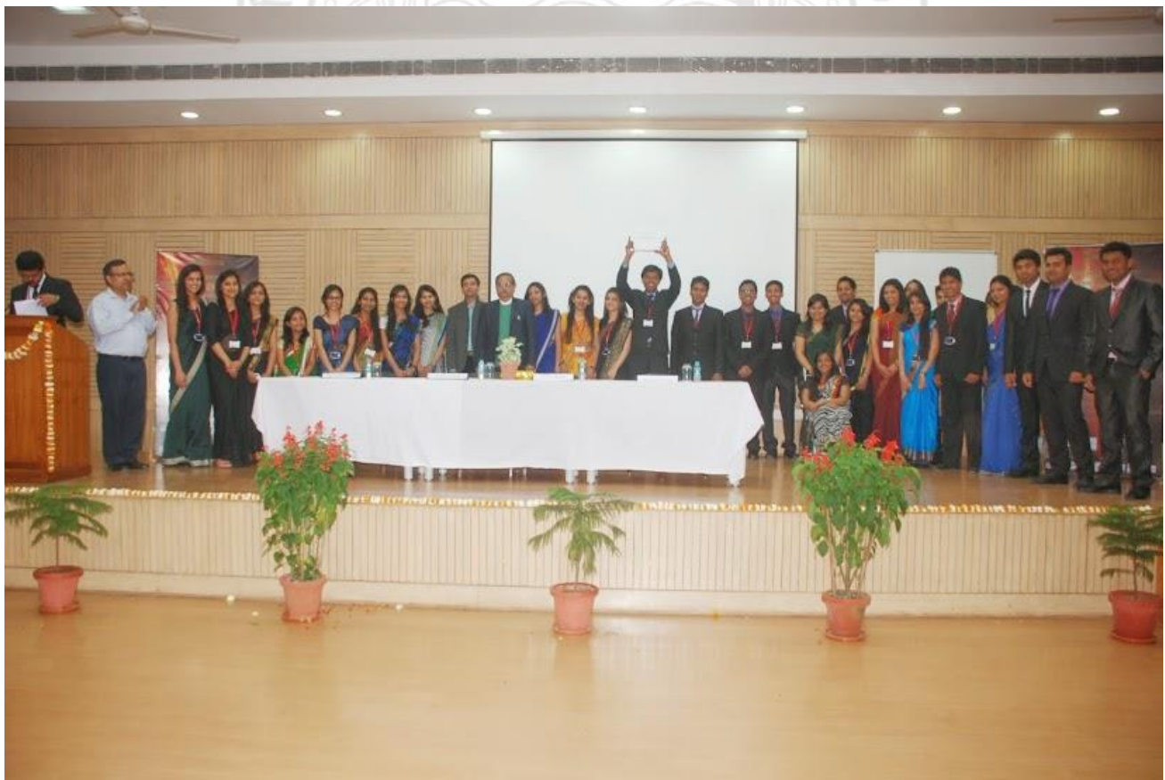
Students of the department receiving INTRA-SANKALAN certificates