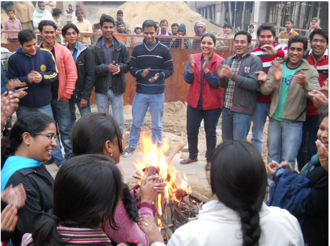
Lohri Celebration at the Department

industry and guide us towards a better future. Various games are played, small skits are arranged and a sense of togetherness is celebrated every weekend.